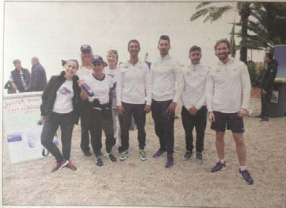
Les membres de l'association TAF, accompagnés par l'équipe de l'École Bleue, ont lancé, hier matin, une opération de prévention sur la plage du Larvotto.